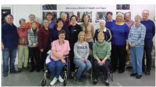
St. Matthews Women's Club